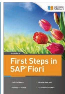
The latest book on SAP Fiori released in April 2017