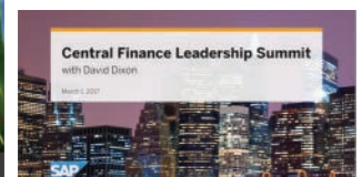
TruQua was recently invited to participate in the SAP Central Finance Leadership Summit: https://www.youtube.com/watch?v=Kdjj9PWsGGM