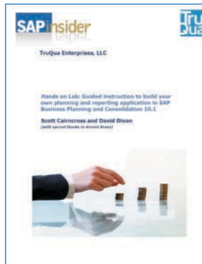
Built a Full Day Hands on BPC Lab run at numerous SAPinsider Events