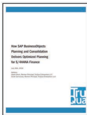
Sponsored by SAP to write a BPC optimized for S/4HANA Whitepaper

TruQua has led to presentations, Q&A forums, webinars, books and SAP-sponsored white papers on SAP BPC, S/4HANA, SAP Central Finance and more